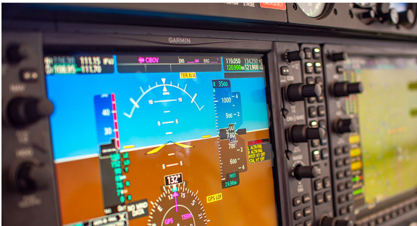
ASI-Group is now a Garmin dealer, specializing in complex avionics retrofits, complex autopilot installation and legacy avionics interfacing.

E-mail: t.laudet@asi-innovation.fr —Phone: +33 6 83 69 53 83